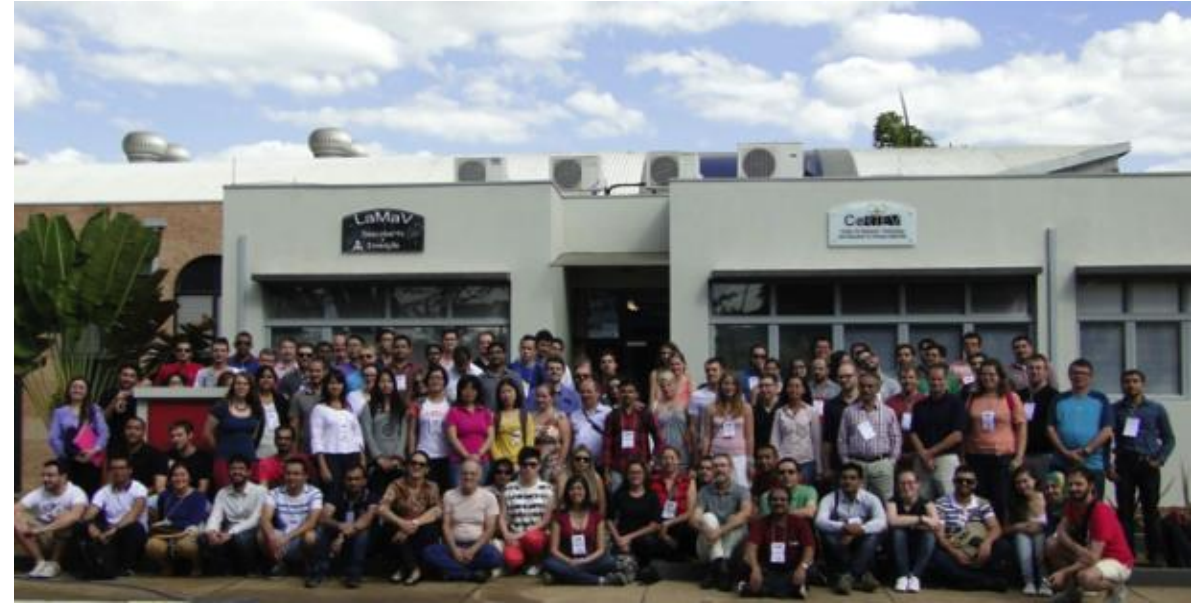
Vitreous Materials Lab (LaMaV) at Federal University of São Carlos (<u>lamav.weebly.com</u>). Instructors and attendees of the <i>First School (2015) with 70 international students and 30 Brazilians.